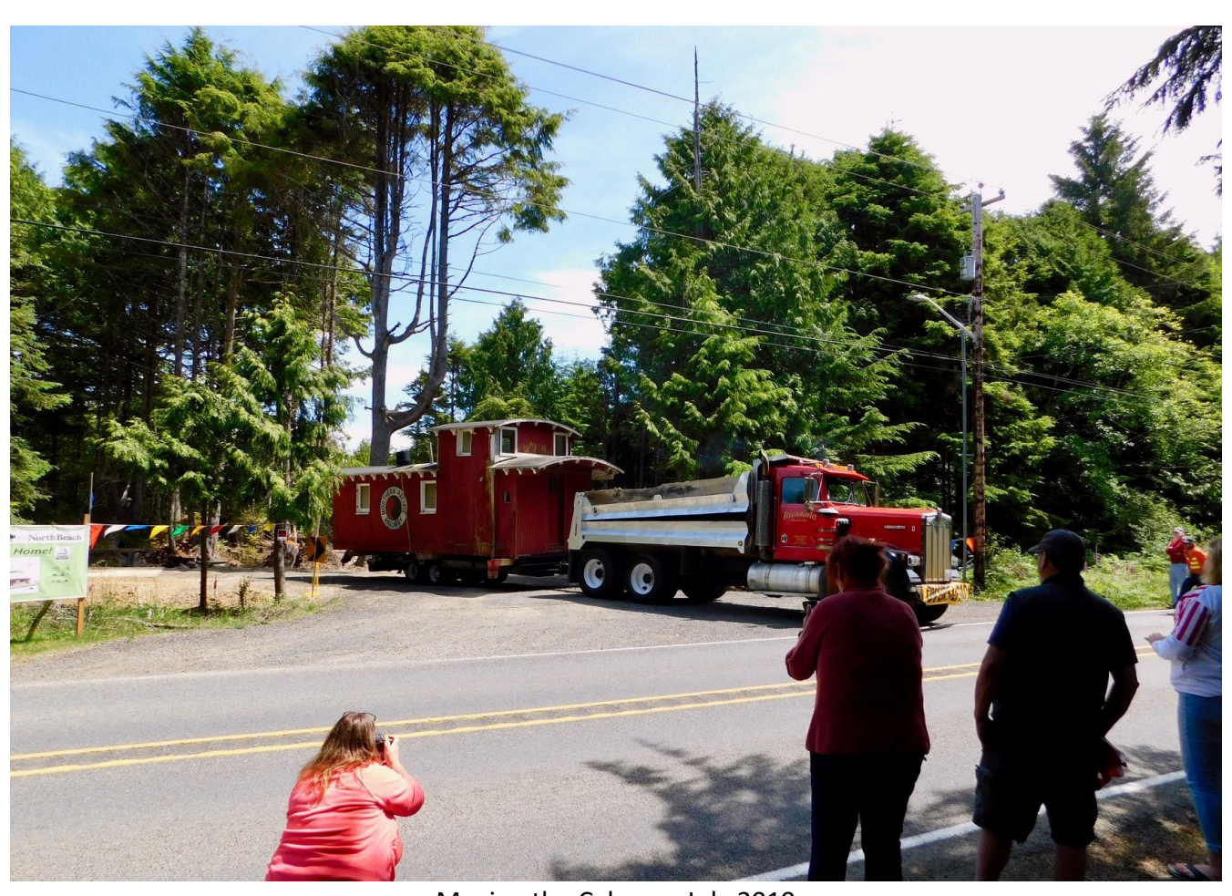
Moving the Caboose July 2019