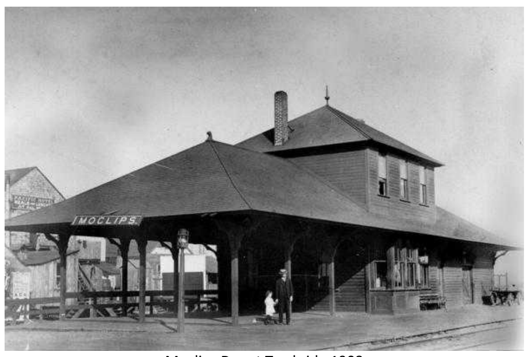
Moclips Depot Trackside 1908

(Year determined from a sign in the lower-left corner advertising the Barnum & Bailey Circus in Tacoma and Centralia on August 22 and 24.)