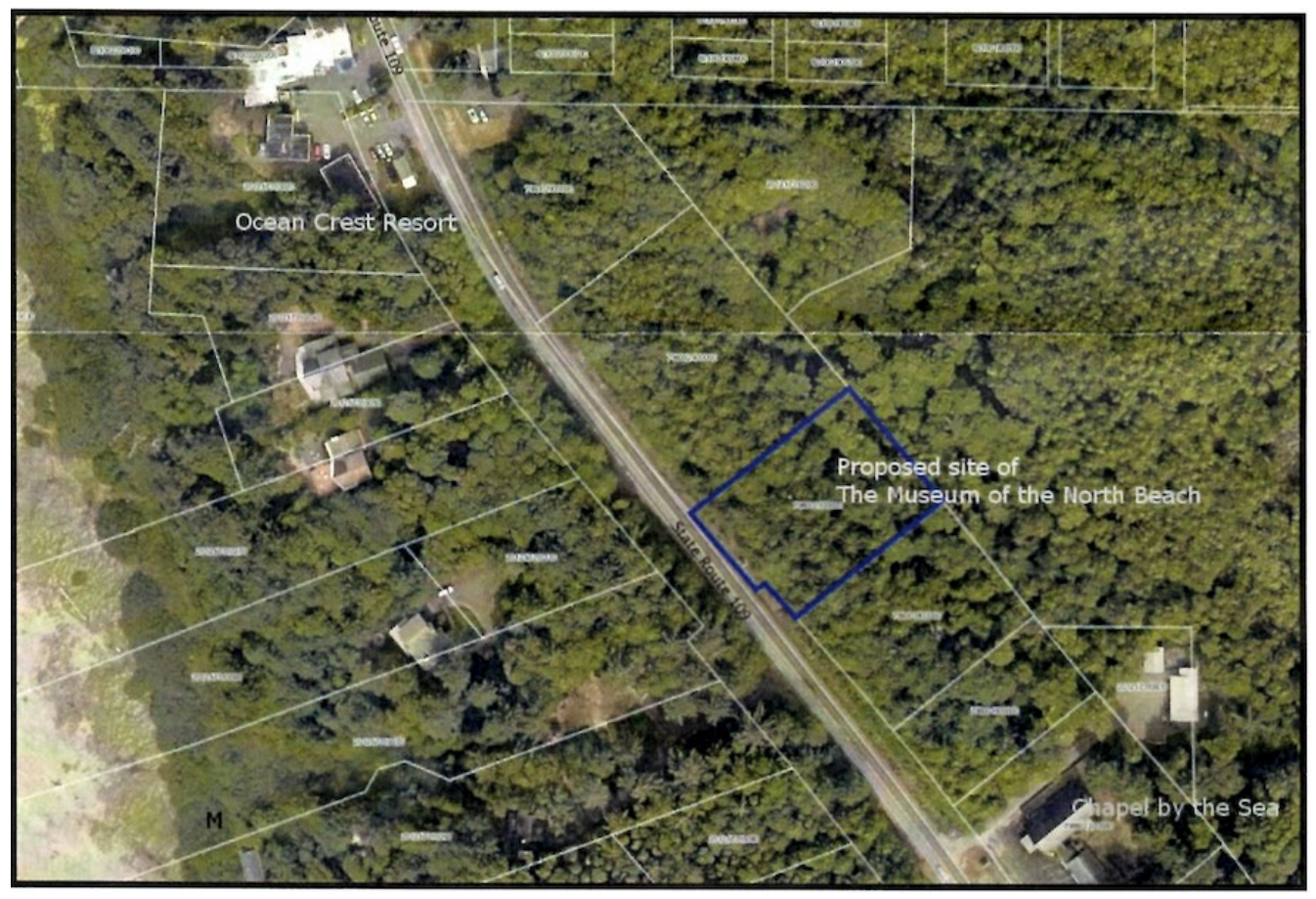
Aerial of the New Museum Site